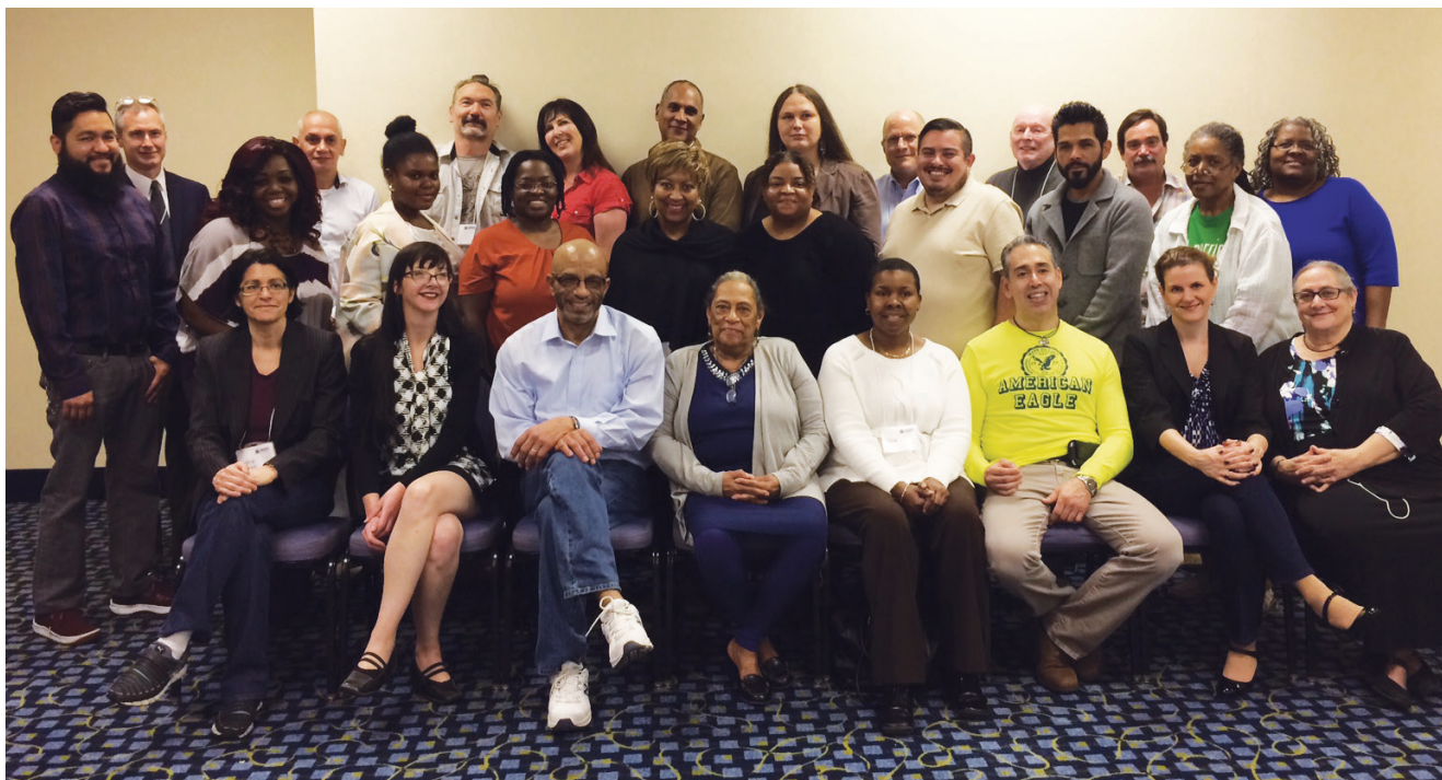
UCHAPS Members Meet to Develop Strategic Plan, February 2015

The three day HIV Trends Think Tank meeting and workshop hosted in May 2015 was the first of its kind giving public health practitioners and thought-leaders from national HIV/AIDS organizations, states, and local urban health jurisdictions the opportunity to come together to engage, exchange experiences, and share HIV program expertise.